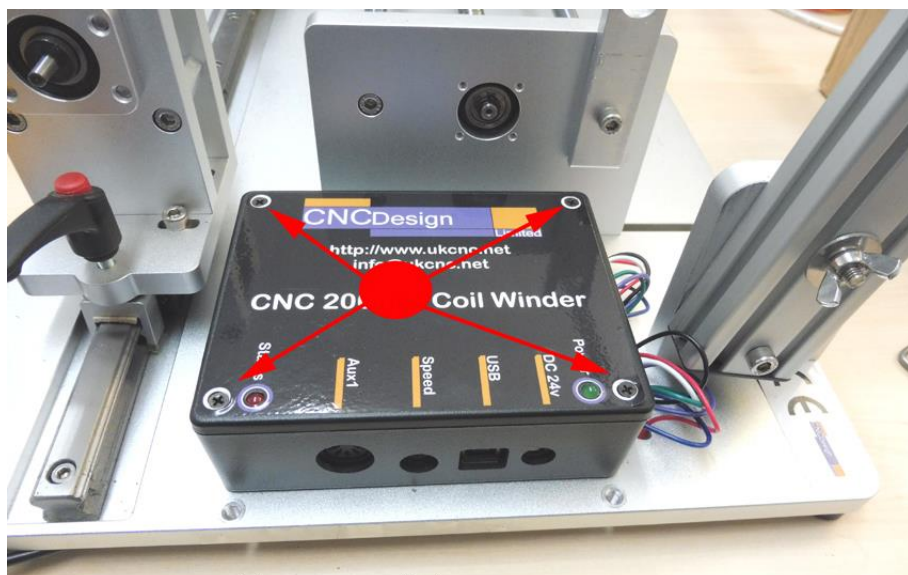
Remove lid screws

You will need your CNC 200mm Coil Winder MK1 and the new Arm Controller board.